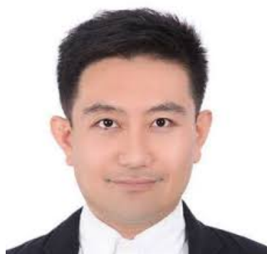
For profit company Endo Atsushi (.jp)