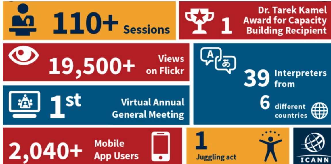
ICANN69 by the numbers.