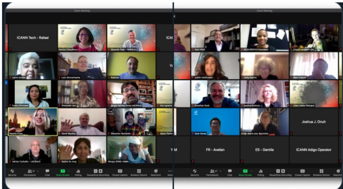
ALAC/At-Large Community members during the ICANN69 Virtual Annual General Meeting