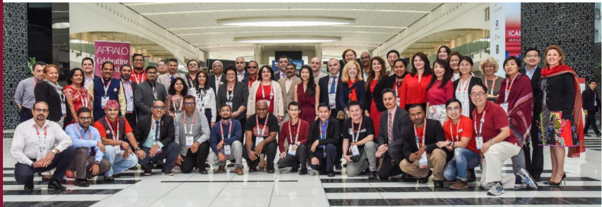
The APRALO family during the ICANN60 Annual General Meeting (AGM) in Abu Dhabi, October 2017.