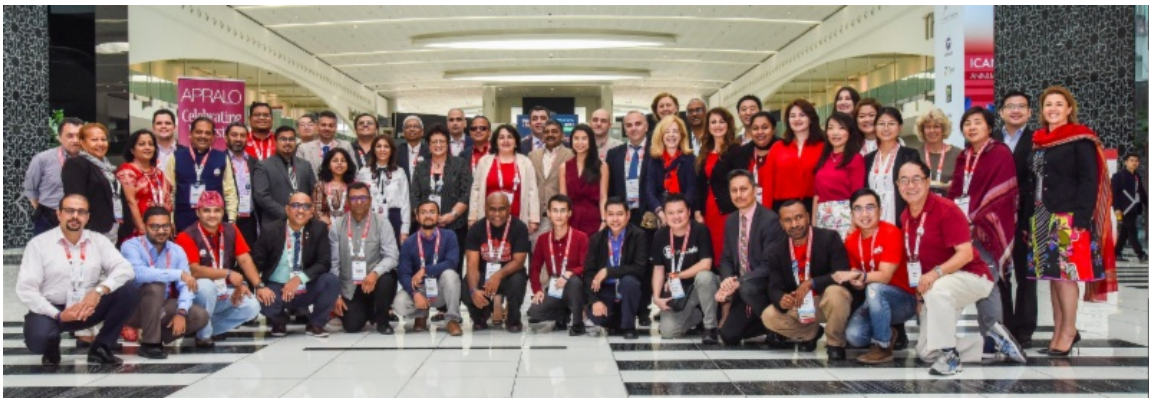
The APRALO family during ICANN60 Annual General Meeting (AGM) in Abu Dhabi, October 2017.

Message from the ALAC Chair: ALAC Activities @ ICANN69