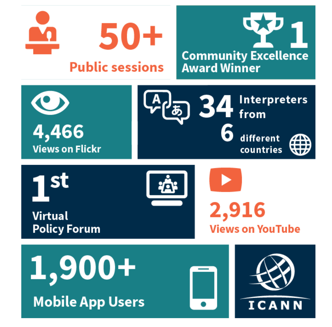
ICANN68 Virtual Policy Forum, 22-25 June

ICANN68 was the first Virtual Policy Forum held, with over 50 public sessions. The At-Large community also held several prep sessions in advance of ICANN68.