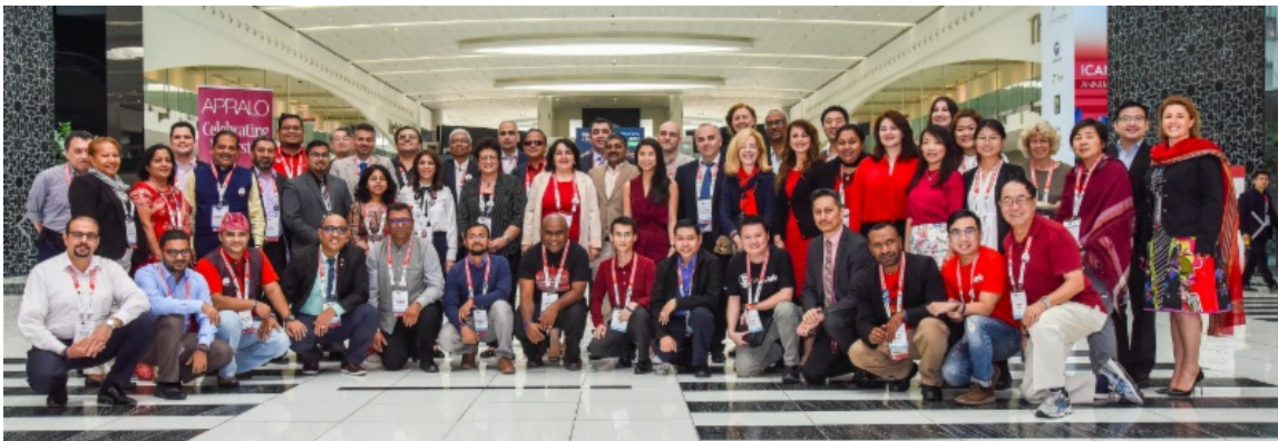
The APRALO family during ICANN60 Annual General Meeting (AGM) in Abu Dhabi, October 2017.