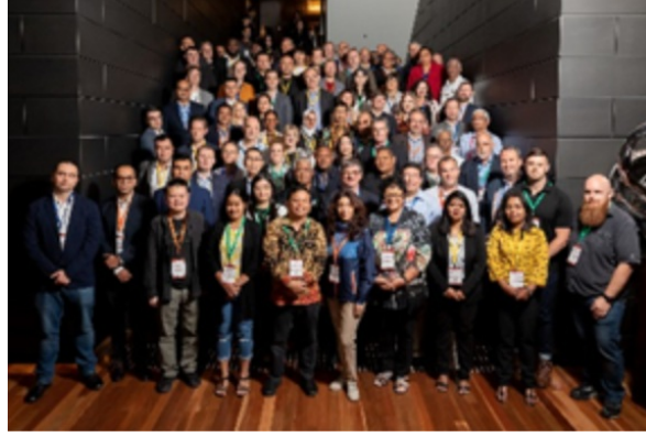
APTD Participants, Melbourne, Australia, February 2020