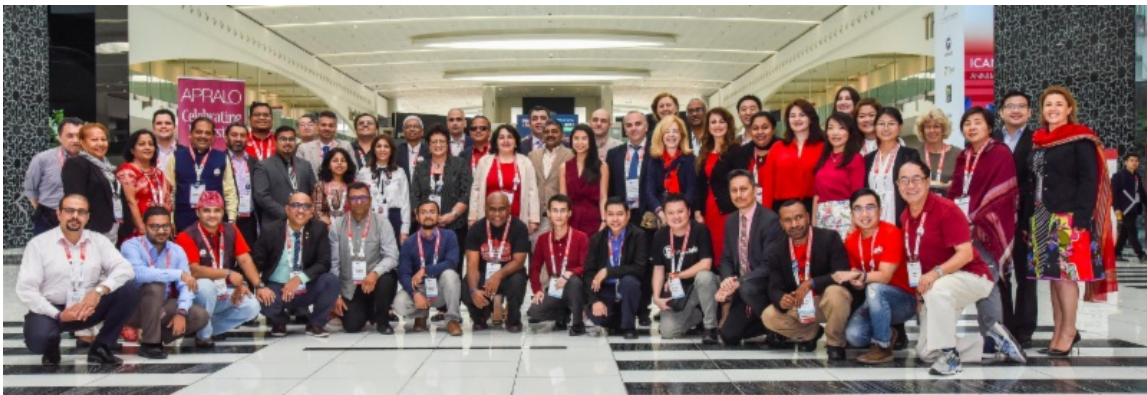
The APRALO family during ICANN60 Annual General Meeting (AGM) in Abu Dhabi, October 2017.

Stay tuned for the March 2020 APRALO Newsletter!