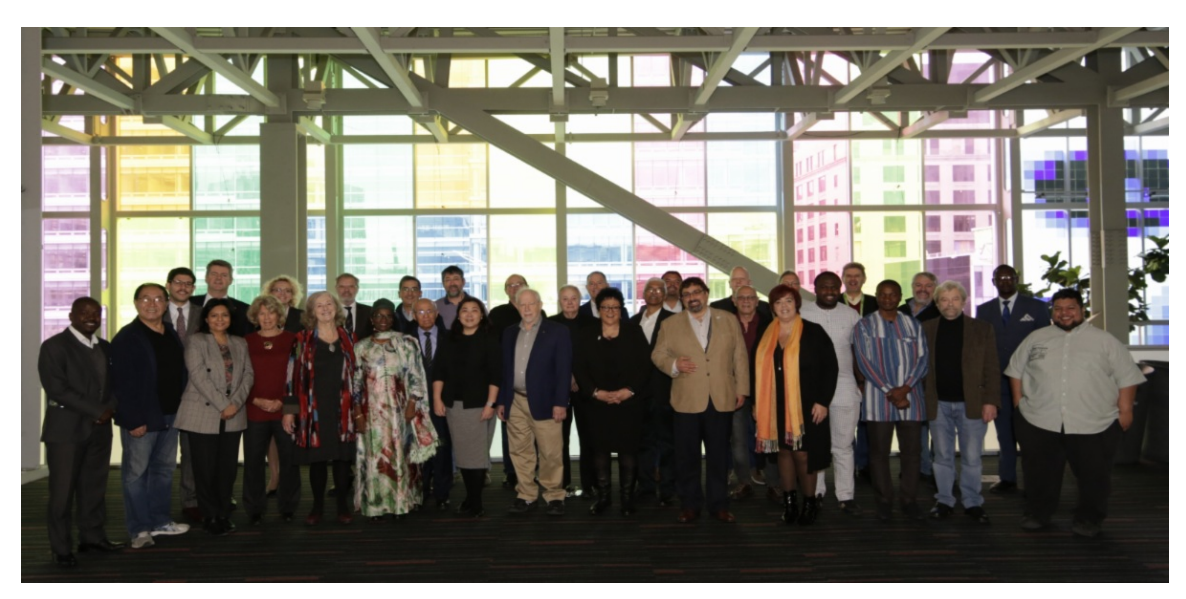
Members of the At-Large leadership (including ALAC and RALO leaders) at ICANN66 / ATLAS III