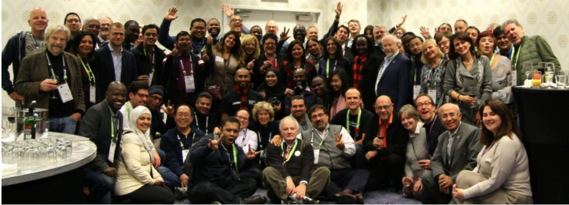
The ATLAS III Welcome Reception in Montreal

See ongoing Post-ATLAS III Activities here .