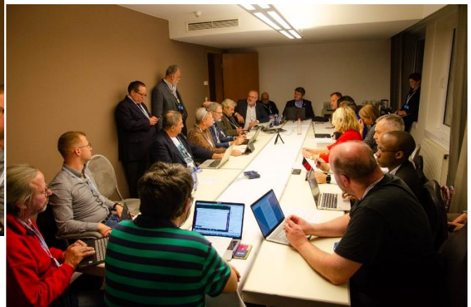
EURALO GA2019, Berlin