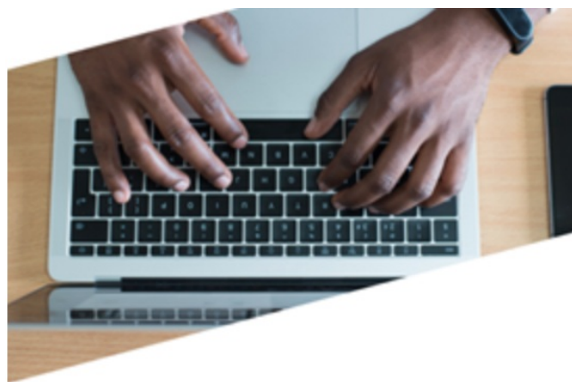
Livre blanc des initiatives

In 2020, three major activities of Femme & Internet program have been carried out. The last one was a webinar with more than 50 women and 07 panelists that took place online on Saturday 19 September 2020. The main objective of the program is to increase women Leadership in the Internet ecosystem.