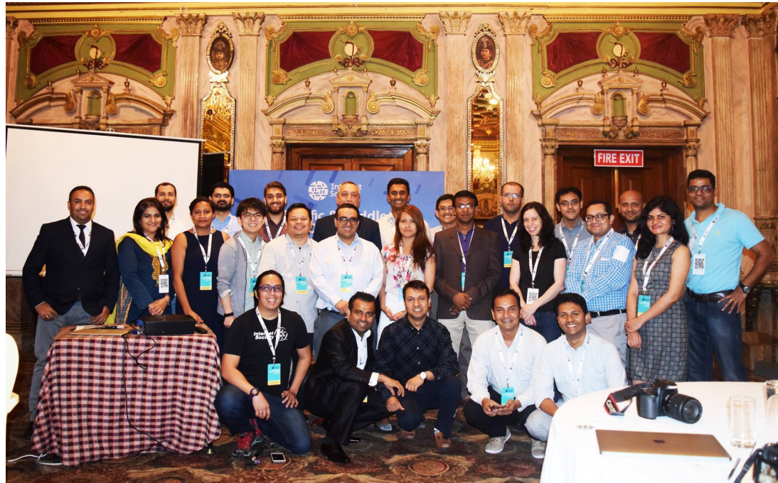
5. ISOC Chapters Meeting 2018 - APAC ME