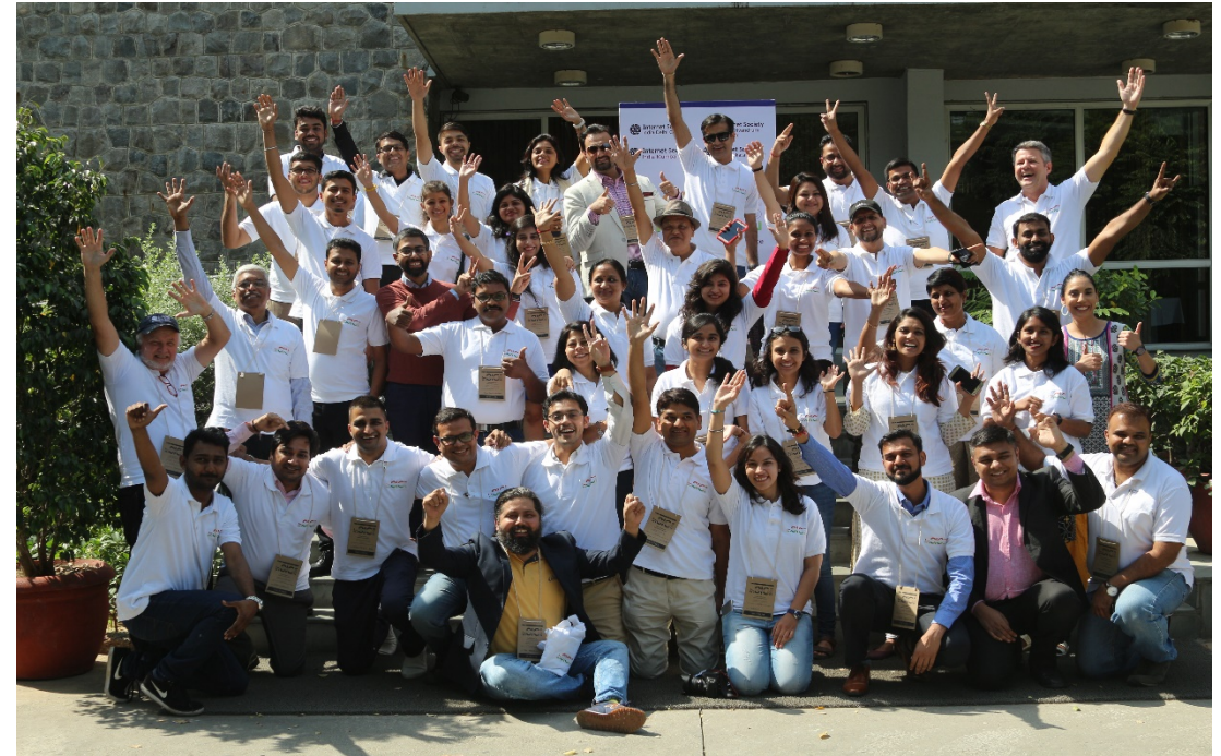
6. India School on Internet Governance (InSIG) with ISOC Delhi, Kolkata and Trivandrum