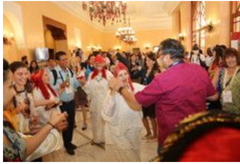
Traditional Moroccan Music and Dancing