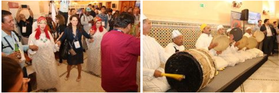
Short Video of Performance https://youtu.be/MVZ-GV3gK60