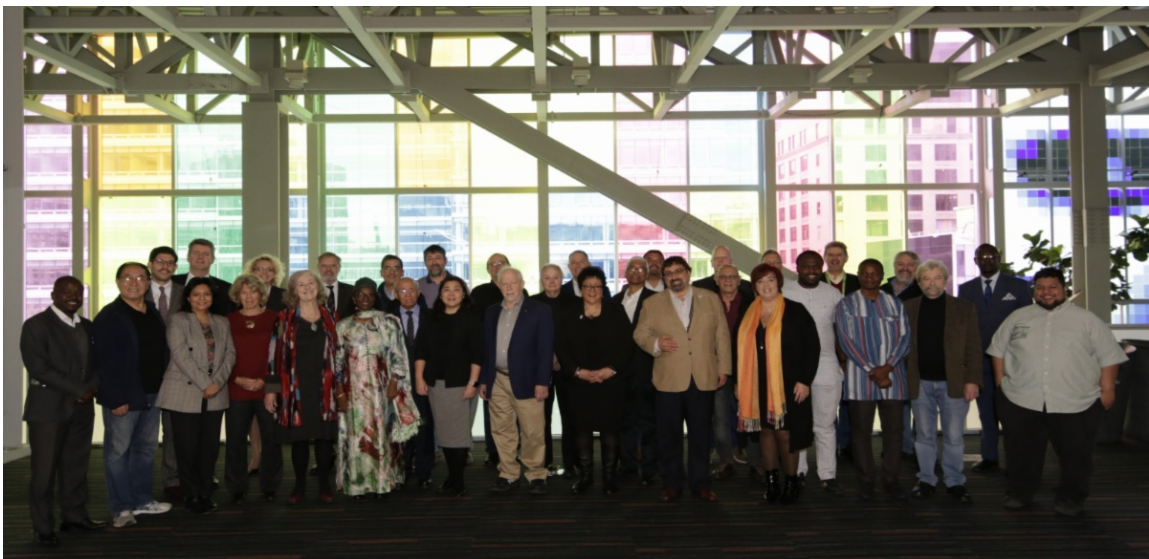
Members of the At-Large leadership (including ALAC and RALO leaders) at ICANN66 / ATLAS III