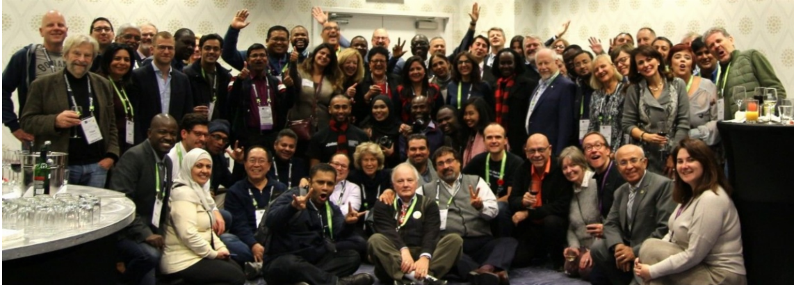
The ATLAS III Welcome Reception in Montreal