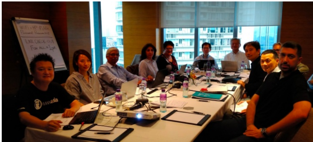
Board of DotAsia in Hong Kong, with APRALO Leaders.