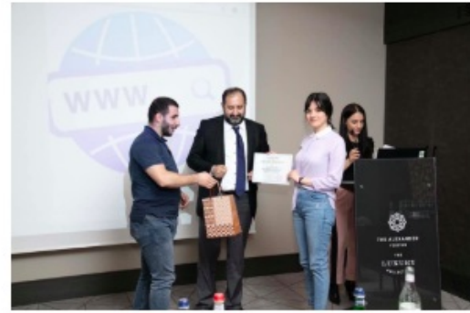
Intellectual Property Day activities.