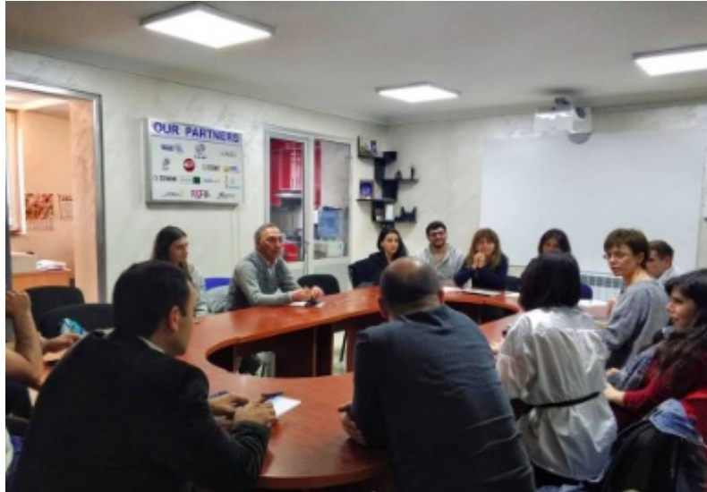
ISOC Armenia met with ccTLD Registrars.

On 17 April ISOC Armenia hosted a meeting with .am/.huq ccTLD registrars to discuss emerging policy and administrative issues pertaining domain name registrations. Also mentioned that such meetings would be continuous to promote a solid working relationship.