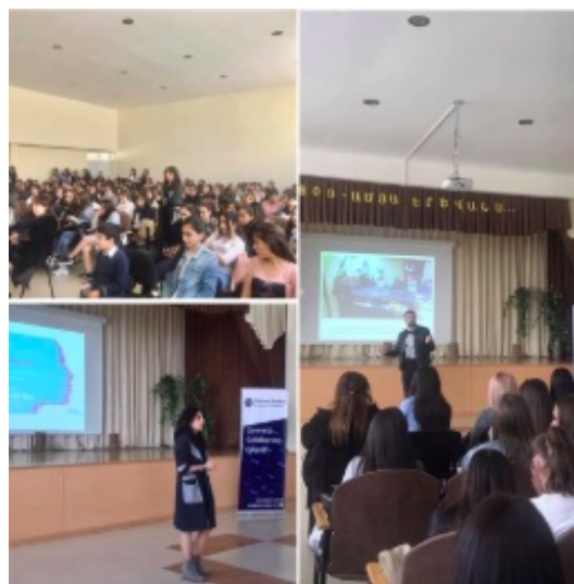
Girls in ICT Day with ISOC Armenia.

On 25 April, #GirlsInICT Day Internet Society Armenia Chapter organized an informative seminar on Cyber Hygiene or how to stay safe in Internet. The seminar took place at one of the suburb school of Yerevan, Armenia. The event hosted around 200 schoolgirls, their mothers and the school staff. The most common types of cyber attacks were represented as well the basics to recognize and avoid them. Young participants were active in their questions encouraged by the dynamic format of the meeting.