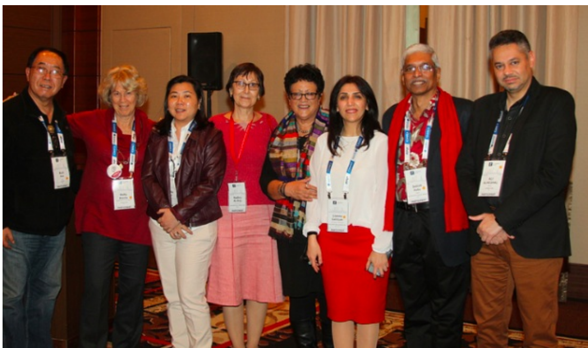
APRALO Leadership during APAC Space @ICANN64.