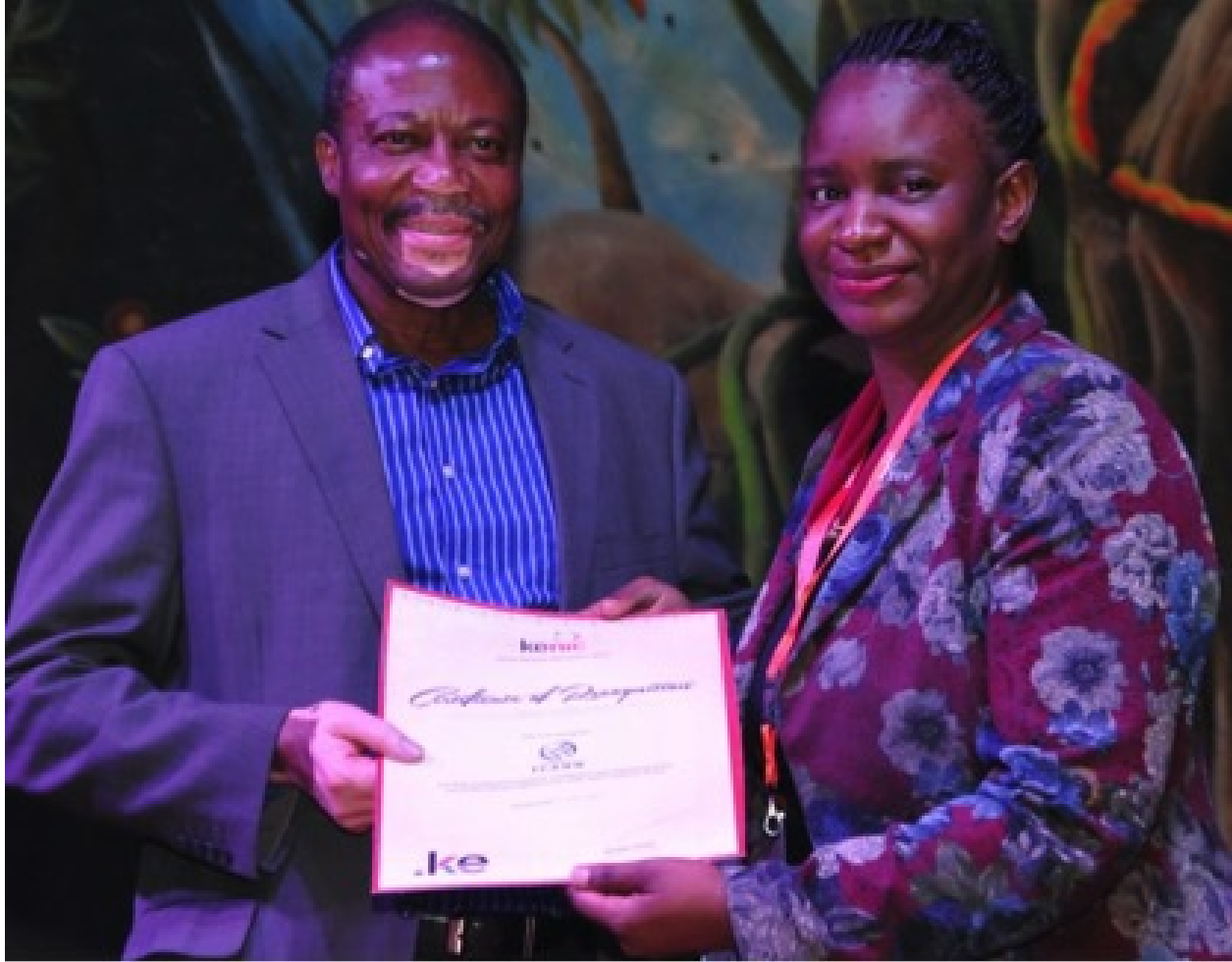
ICANN Receiving a thank you Award for Sponsoring the Africa DNS Forum

The third edition of the Africa DNS Forum was an absolute success, demonstrating how this event has grown over the past three years. Throughout the event, there was consistent attendance, and rich debates that highlighted the potential for cooperation, that the Nairobi gathering made possible.